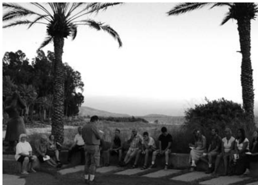
DAILY DEVOTIONS WITH THE SEA OF GALILEE IN THE BACKGROUND

Is the program worth it? On balance, we certainly think so!