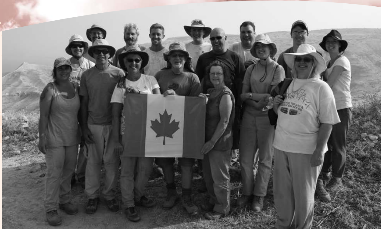
WHAT A CREW! THE 2014 ARCHAEOLOGY VOLUNTEERS, ON THE DIG-SITE AT HIPPOS.