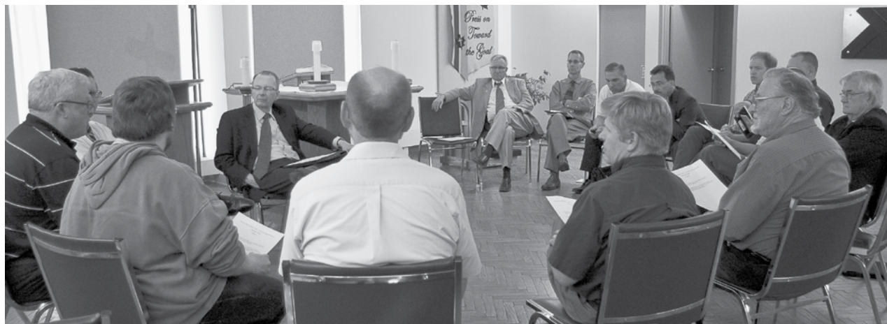
Pastors gathered to explore these presented by colleagues and responding to the keynote address

The seminary looks forward to hosting the 3rd Annual Pastoral Gathering next year.