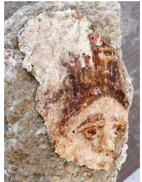
Painted Tyche head

A wide selection of high-quality goods was found in this building, too, including an extremely rare painted