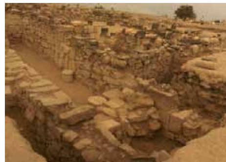
Hippos, site of archaeological dig

On the dig-site, the experience was equally riveting. Previous work had exposed Hippos' "North-East Church," which functioned as a pilgrimage site